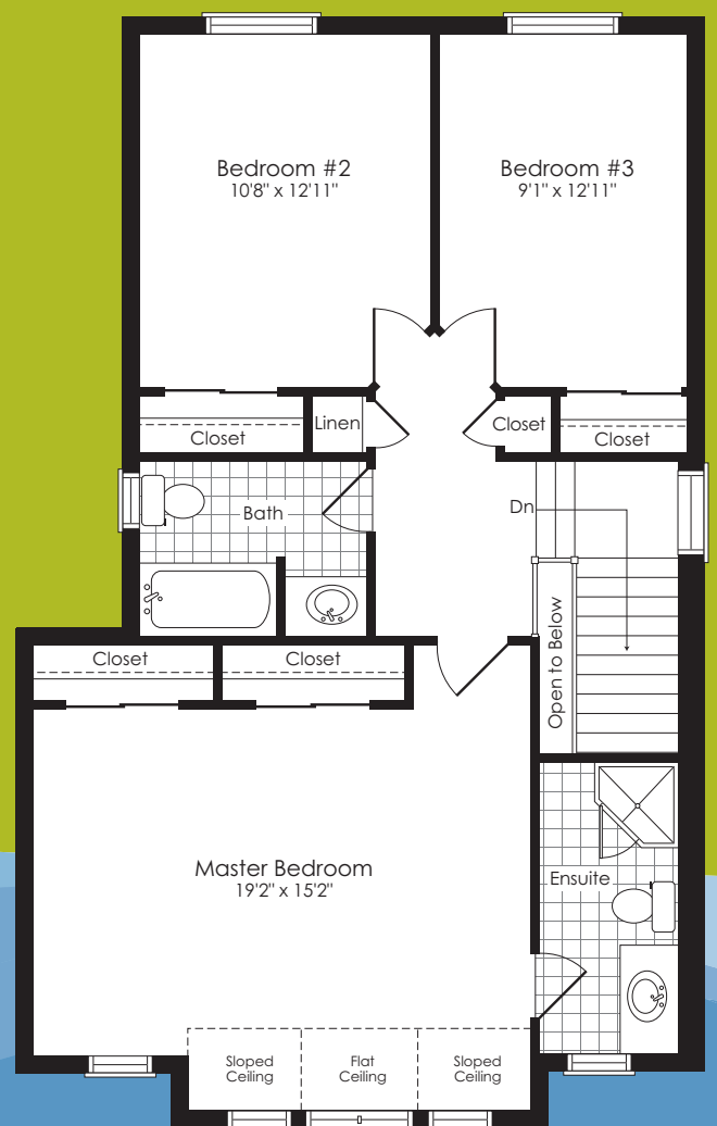
Optional Alternate Second Floor